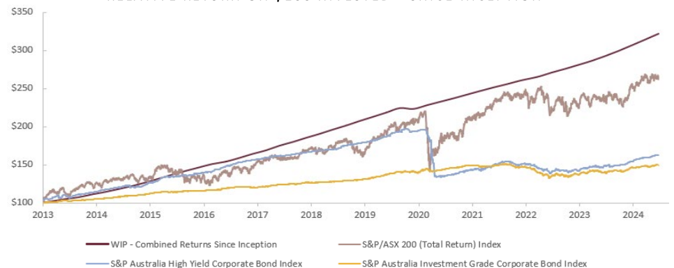
RELATIVE RETURN ON $100 INVESTED – SINCE INCEPTION 2

For more than a decade, WIP has delivered steady and consistent returns. As depicted in the chart below, these returns are not as correlated with other traditional investments, such as Australian equities and high yield corporate bonds. WIP has also delivered stronger returns than other defensive income yielding investments.