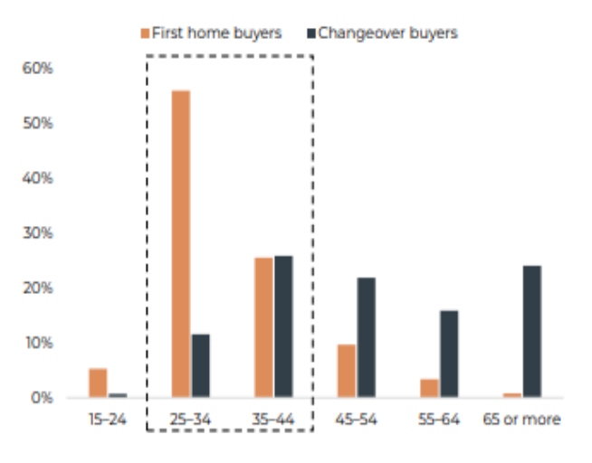
Chart 2 - First Home Buyer by Age Demographic and Age

Another interesting data point is that first homebuyers reside in the top third or fourth quintile for equivalised household income.